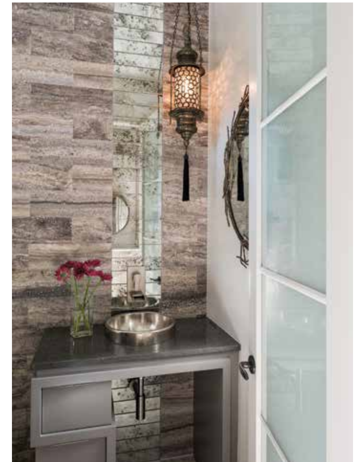
The master suite epitomizes relaxed, indoor/outdoor living. Top, left to right: Behind a floating divider clad in Romo wall covering, the “womb-like” bedroom features a door opening onto the pool terrace. The master bath (above, left and right) balances masculine and feminine elements, with its wooden vanity and delicate mosaics. Also connected to the pool terrace, a powder room (opposite, bottom left and right) boasts custom cabinetry and tile from Marble Systems.