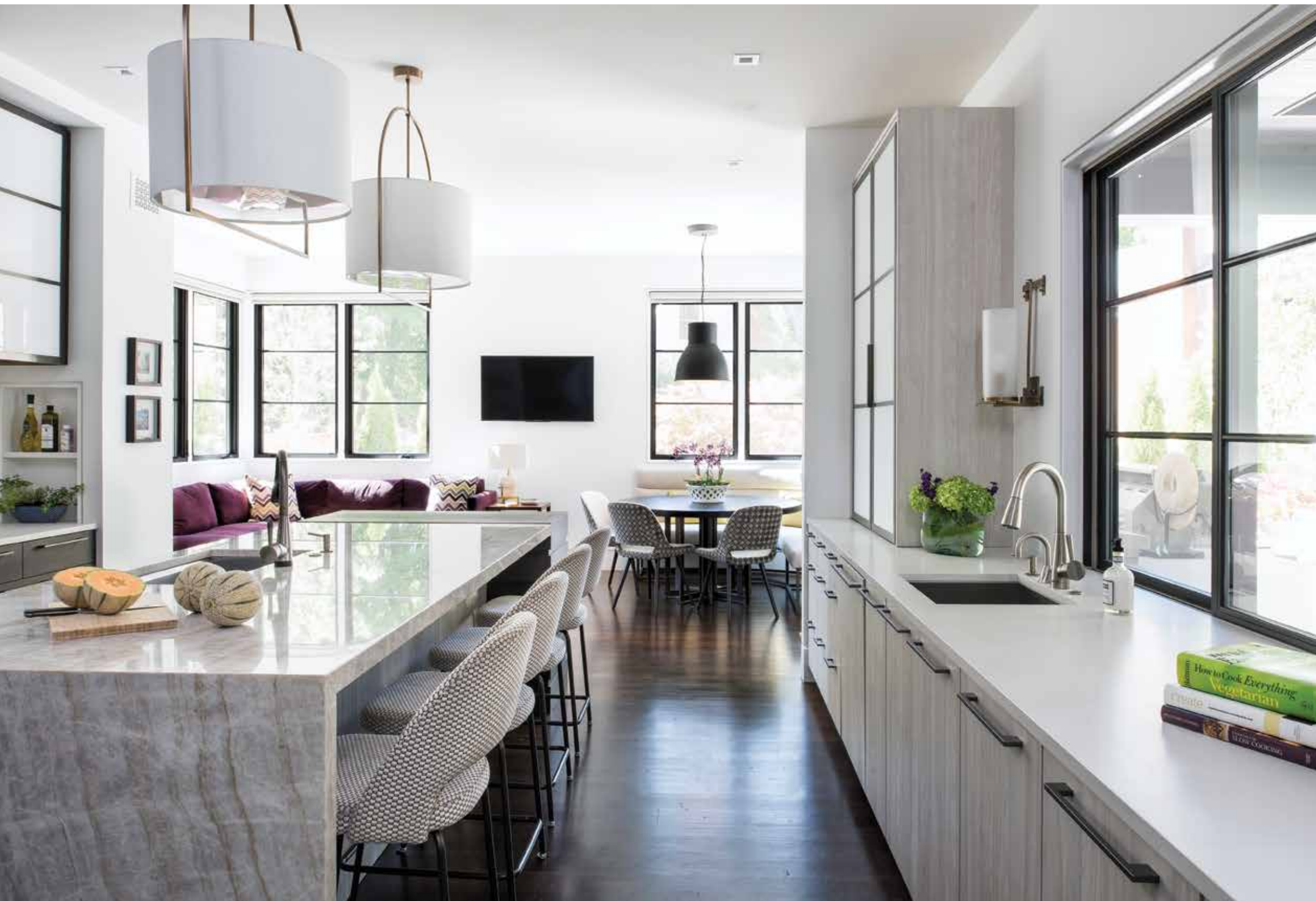
Designed with Meghan Browne of Jennifer Gilmer Kitchen & Bath, the kitchen (above) features a quartzite-topped island with a waterfall edge; custom pendants hang above. The peripheral countertop, made of weatherproof Caesarstone, seamlessly extends to the alfresco bar via a pass-through window. Glass-and-steel cabinet doors echo the style of the home's windows. A cozy sectional and breakfast area with a banquette (opposite) beckon.