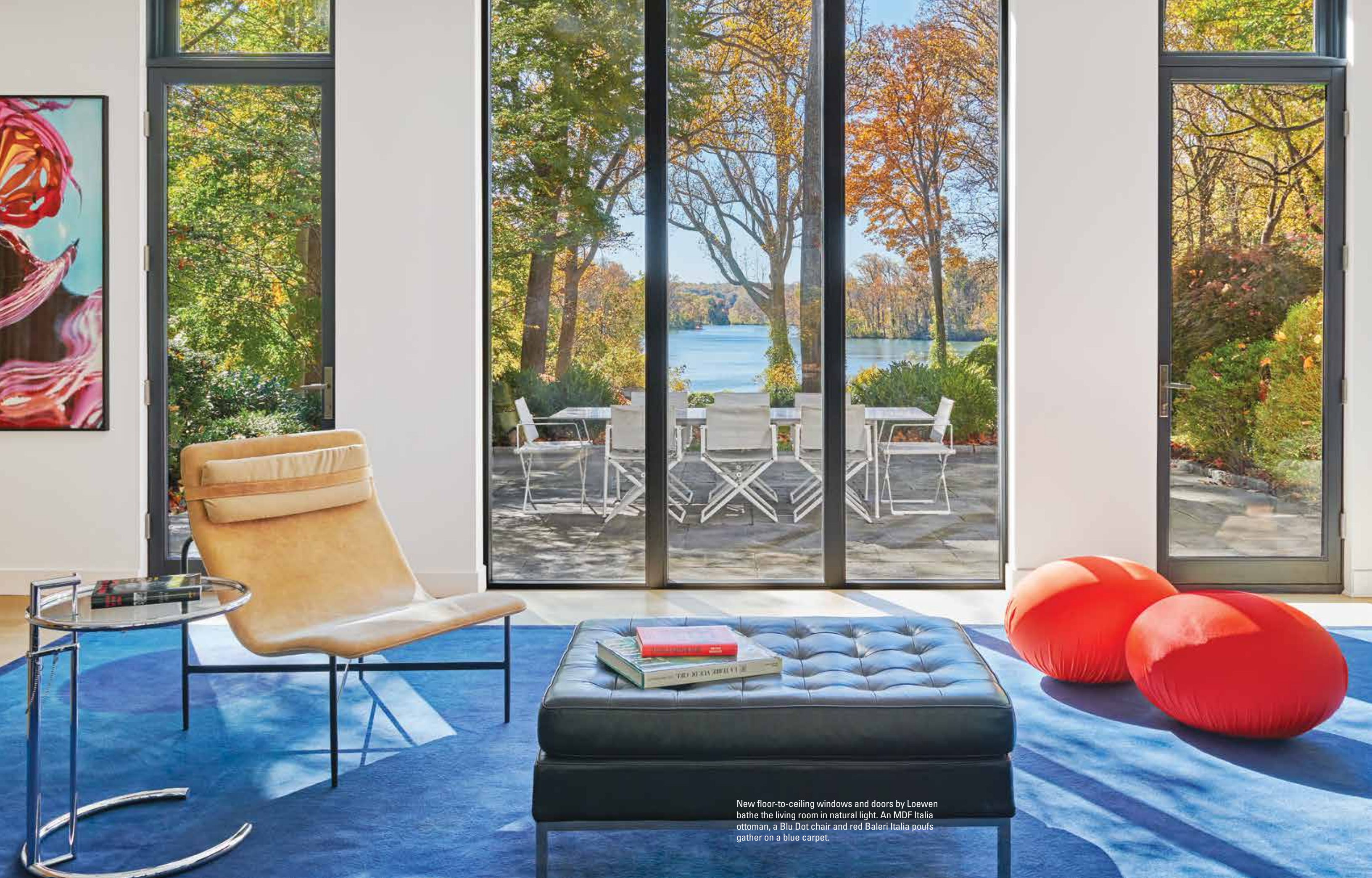
New floor-to-ceiling windows and doors by Loewen bathe the living room in natural light. An MDF Italia ottoman, a Blu Dot chair and red Baleri Italia poufs gather on a blue carpet.