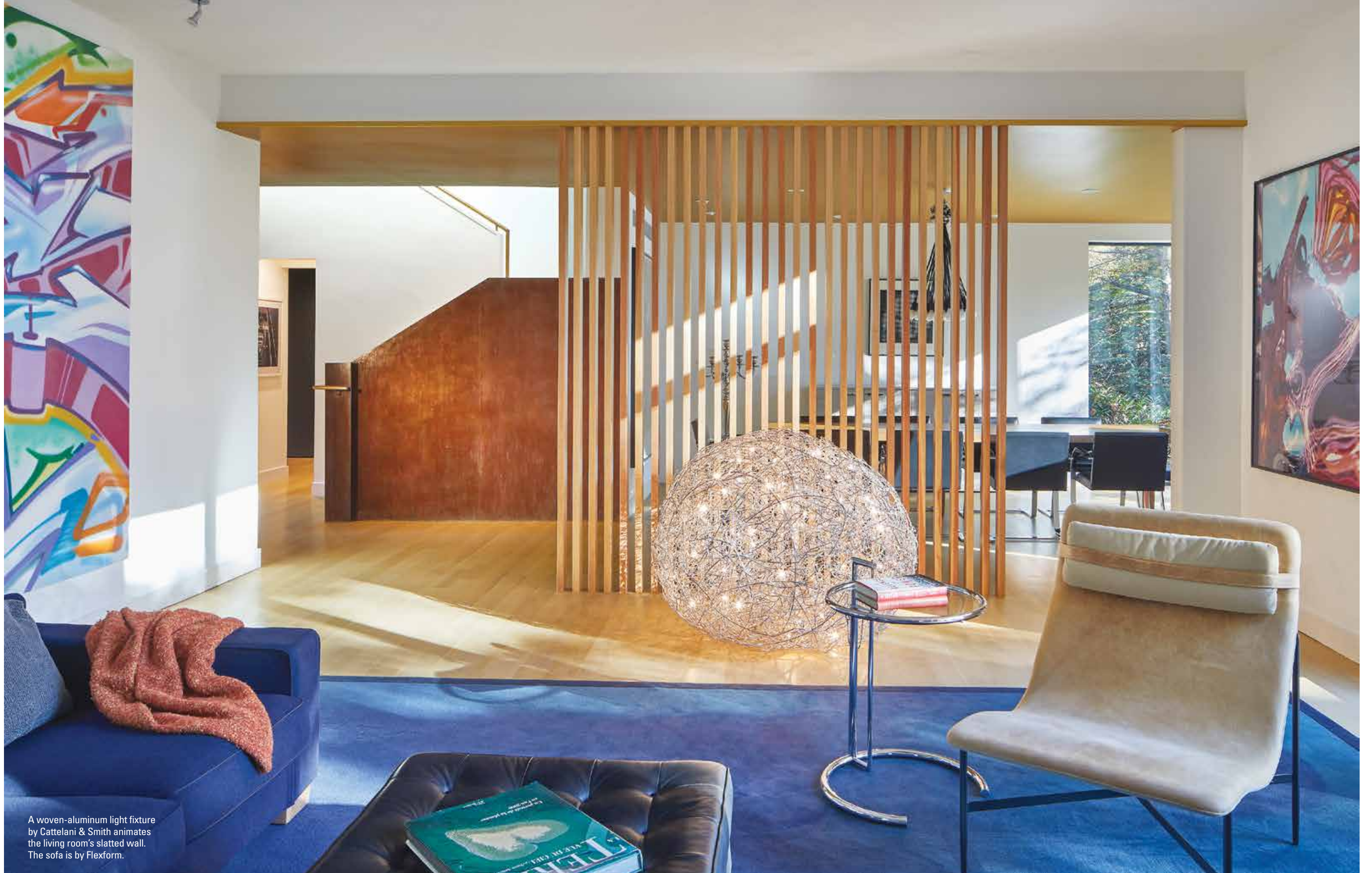
A woven-aluminum light fixture by Cattelan & Smith animates the living room's slatted wall. The sofa is by Flexform.