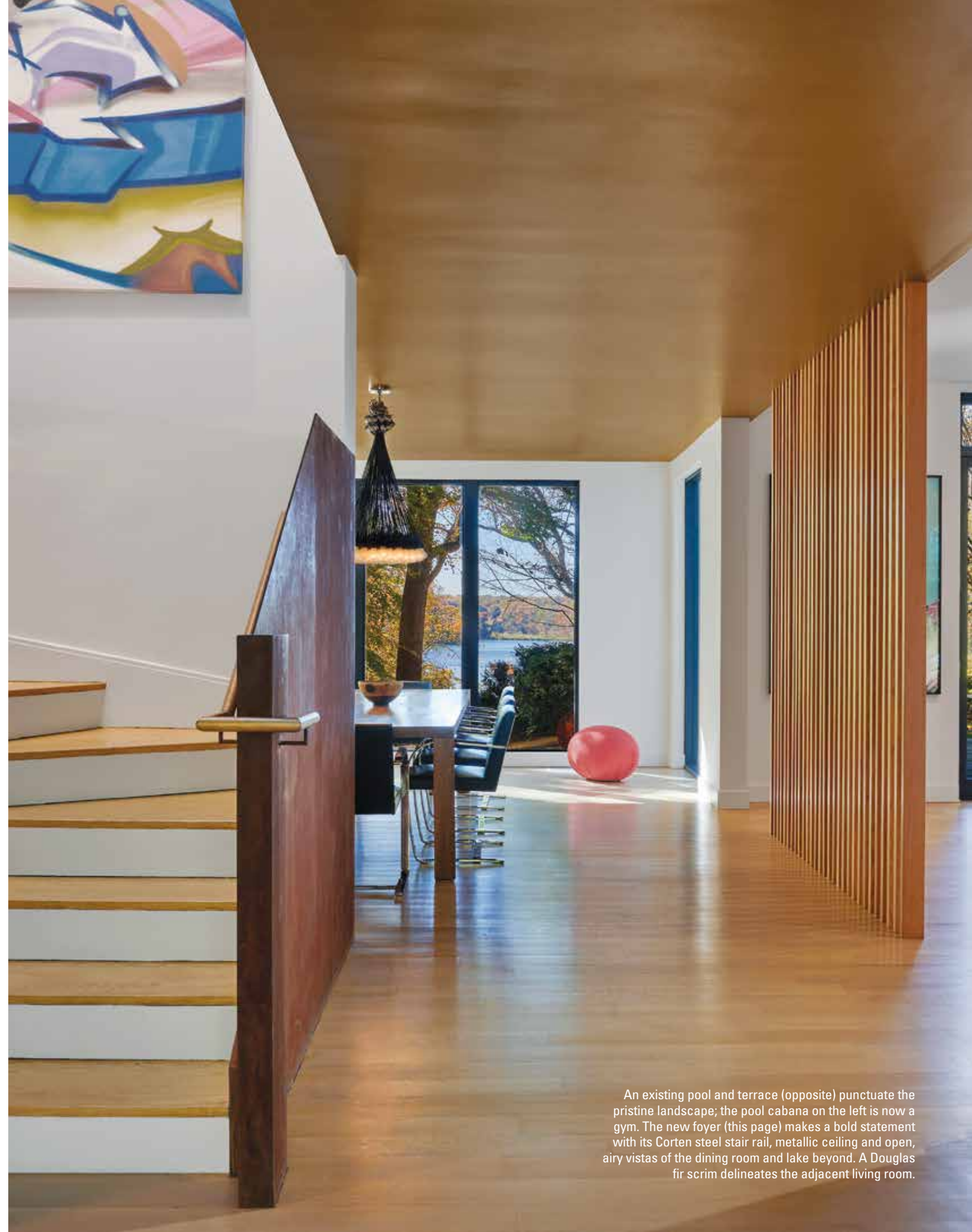
An existing pool and terrace (opposite) punctuate the pristine landscape; the pool cabana on the left is now a gym. The new foyer (this page) makes a bold statement with its Corten steel stair rail, metallic ceiling and open, airy vistas of the dining room and lake beyond. A Douglas fir scrim delineates the adjacent living room.