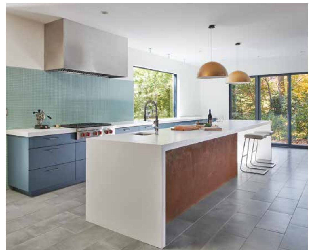
Clockwise from above: The new kitchen occupies the western side of the home. Its cabinets were designed by Richard Williams and fabricated by Ferris Custom Cabinetry. The main sink enjoys a stellar view. Corten steel fronts the large island; Flos pendants echo the patinaed finish. Emser porcelain tiles pave the floor.